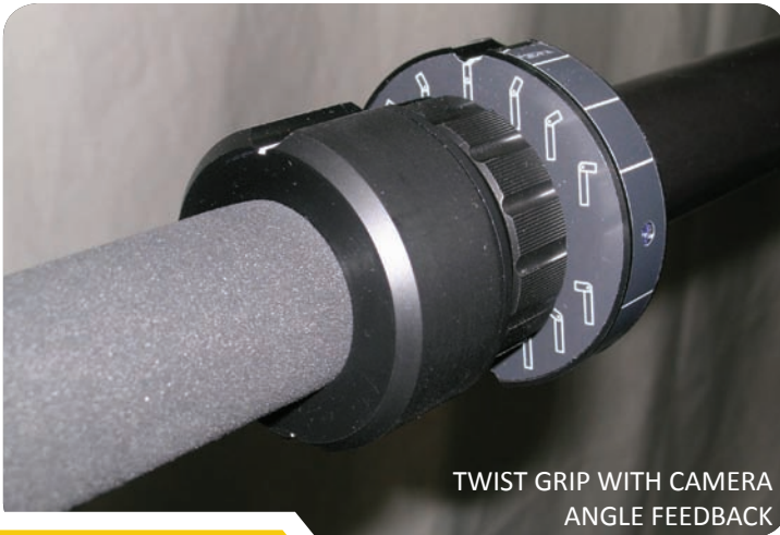
TWIST GRIP WITH CAMERA ANGLE FEEDBACK