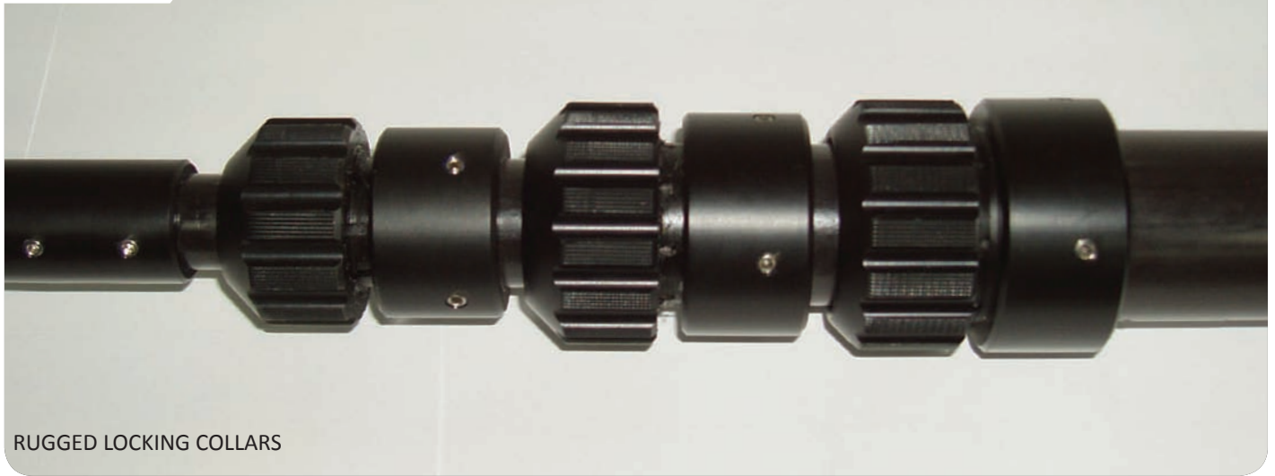
RUGGED LOCKING COLLARS