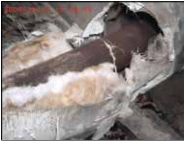
10:1 Color Zoom Camera